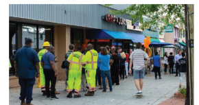
Crisp & Juicy celebrated its anniversary by treating customers to a free lunch on October 10th.

Crisp & Juicy celebrated a decade in Tenleytown this October, and as an early birthday present the restaurant topped the Washington Post's list for the best Peruvian chicken in DC: "After so many years in the business, their charcoal-chicken game is strong."